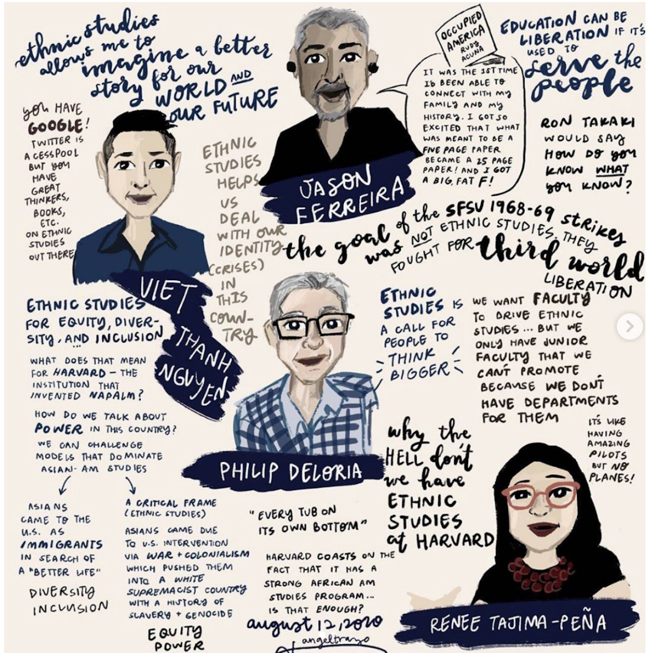
Ethnic Studies scholar-in-the-making Angel Trazo, http://angeltrazo.com/ , captures the event magnificently in the illustration above.